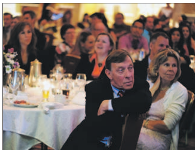
The crowd listens raptly to Debbie Reynolds