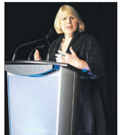
Honourable Deb Matthews, Ontario's Minister of Health and Long-Term Care