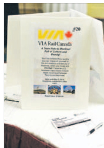
One of the fabulous silent auction items