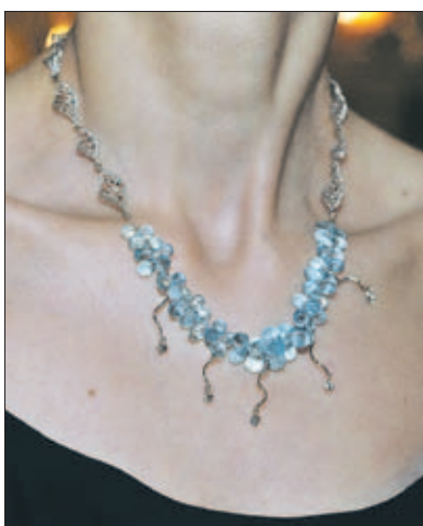
The beautiful necklace provided by Louro Jewellers